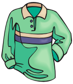
long sleeved shirt