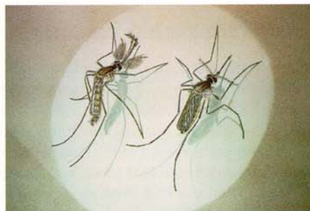
Male (left) and female (right) Culex mosquitoes.