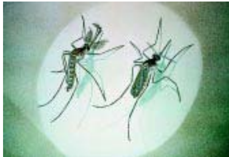
Male (left) and female (right) Culex mosquitoes.