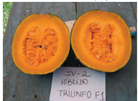
The Brazilian squash ‘Triunfo’