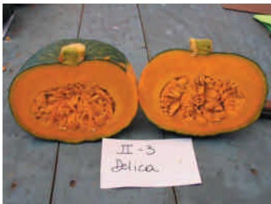
Kabocha variety 'Delica'

Harvest for Pipián began on 20 July when the fruit reached 5" in length, and took place once per week until 28 August. For each harvest, fruit between approximately 5" and 8" in length were harvested, since this size was considered the most desirable in the markets (Mancia 2006). On 22 August all other cultivars were considered to be mature and were harvested. For each harvest date, the fruit from the 10 middle plants were weighed and the length and width of each fruit was recorded. 'Ayote' was not harvested, since very few fruit produced, the largest of which was less than 2" long. Data were analyzed by analysis of variance using standard software (SAS Institute, Cary NC) with the means separated using Duncan's test.