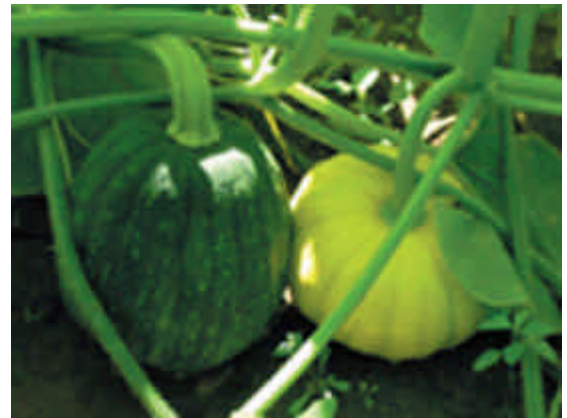
An intra-species of abo'bora japonesa (left) grown with a pollinator variety (right)

Plots were 28’ long by 19.5’ wide and transplants were set 4’ apart in the row, and three rows were 6.5’ apart for a total of 42 plants/plot, equivalent to a plant population of 3,350 plants/acre. Seedlings were transplanted to the UMass field in South Deerfield on 30 May. This arrangement of plants allowed for a border of plants to surround 10 central experimental (sample plants) plants for each plot. For the plots with the ‘Tetsukabuto’ and ‘Triunfo,’ the border rows were planted with the pollinator, ‘Abóbora Moranga.’